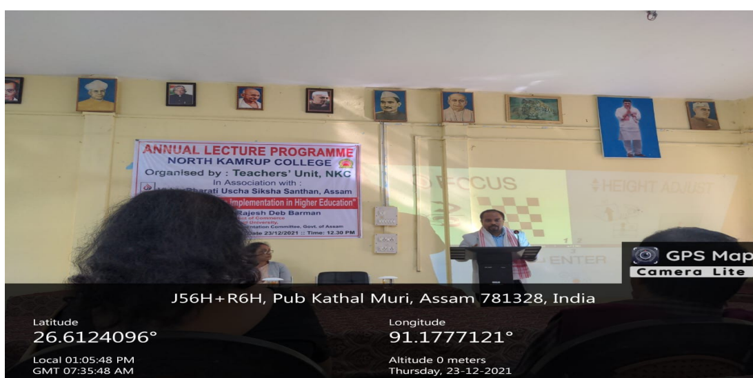
Photo of the event