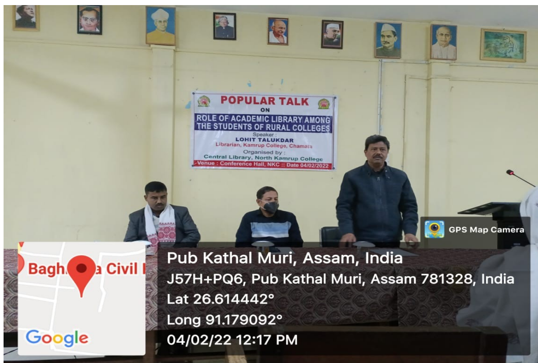
Photo of the event