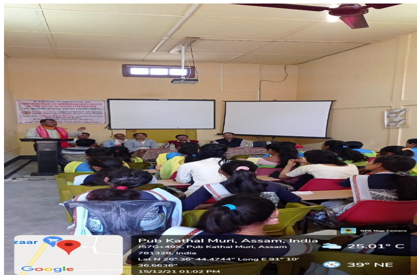
Photo of the event